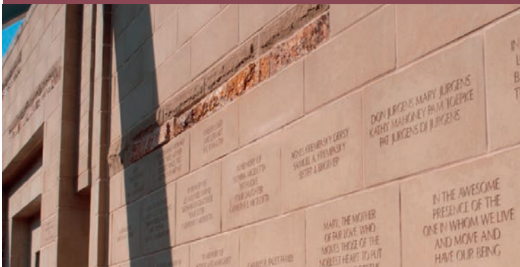
Facing Stones Starting at $3,000