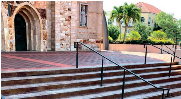
Pavers Starting at $350

from Ave Maria Catholic Church & Resources