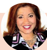
Master of Ceremony