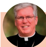
Special Guest Speaker