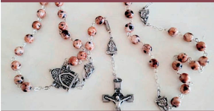
Custom Rosary $85

Email memorials@avemariaparish.org for more info!