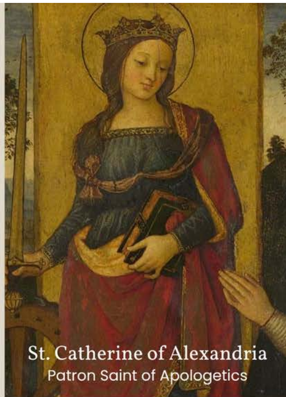
St. Catherine of Alexandria Patron Saint of Apologetics