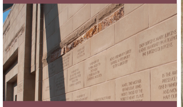
Facing Stones Starting at $3,000